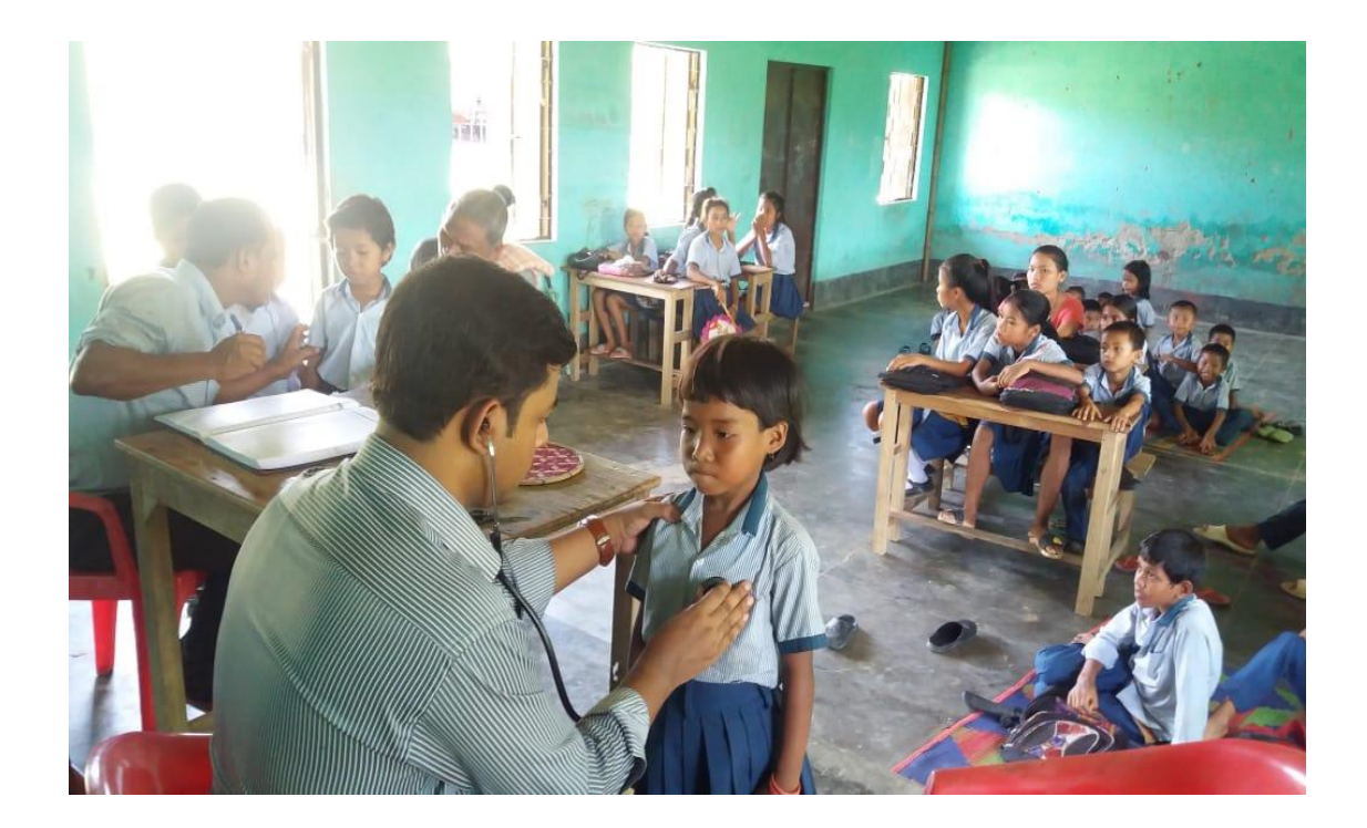
2.22.4 Number of visits made by the RBSK team for the health check- up of the children.